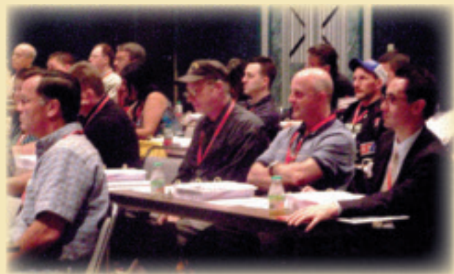
AMSOIL Dealers learned ALTRUM Nutritional Supplements help them diversify their AMSOIL businesses for greater profits.