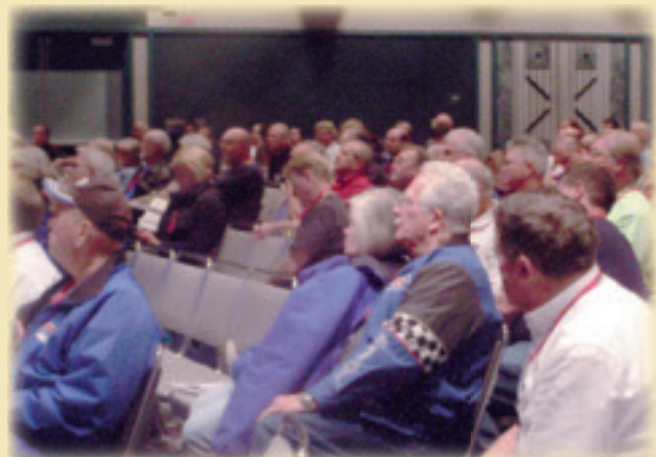
Dealers who attended AU pay close attention as they learn about the many benefits of ALTRUM Nutritional Supplements and how to market them.