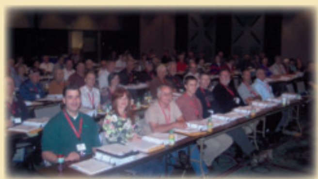
Many Dealers attended the ALTRUM presentations eager to learn more about the nutritional supplements and share that information with new customers. .